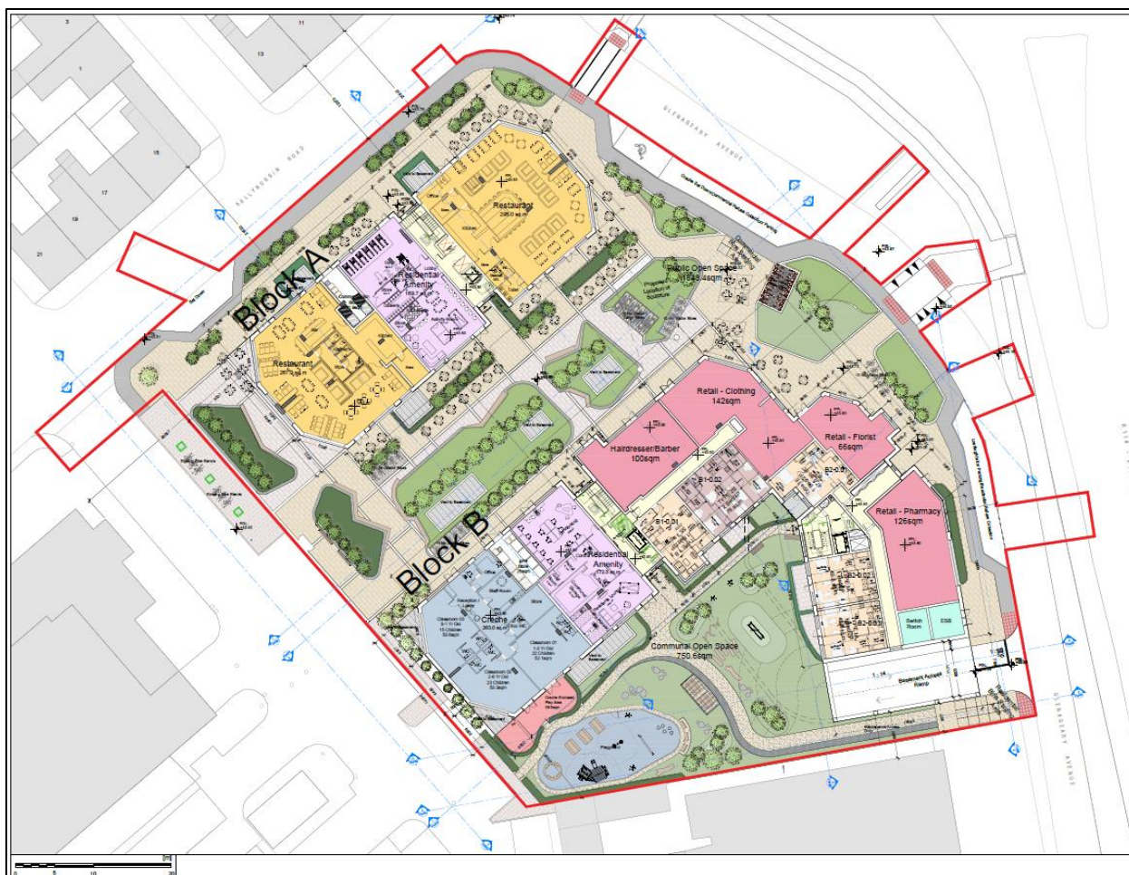
Figure 4.1 Proposed site layout (illustrated by red line boundary)