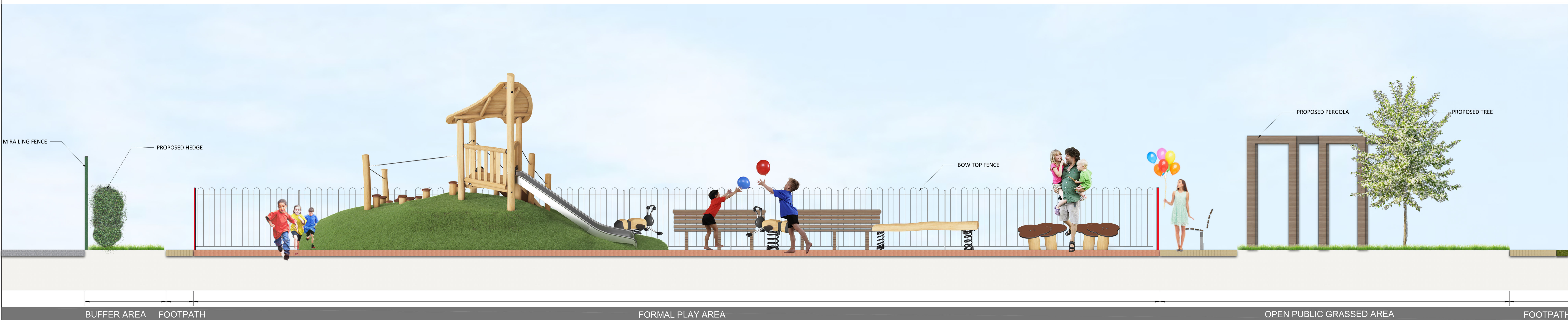
3 | SECTION Scale 1:30