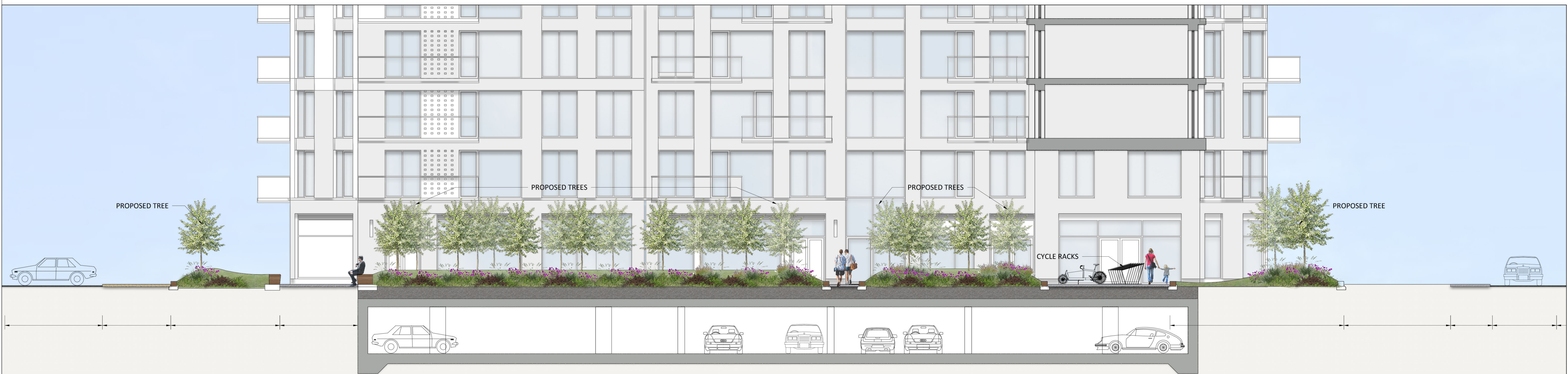
2 | SECTION Scale 1:100