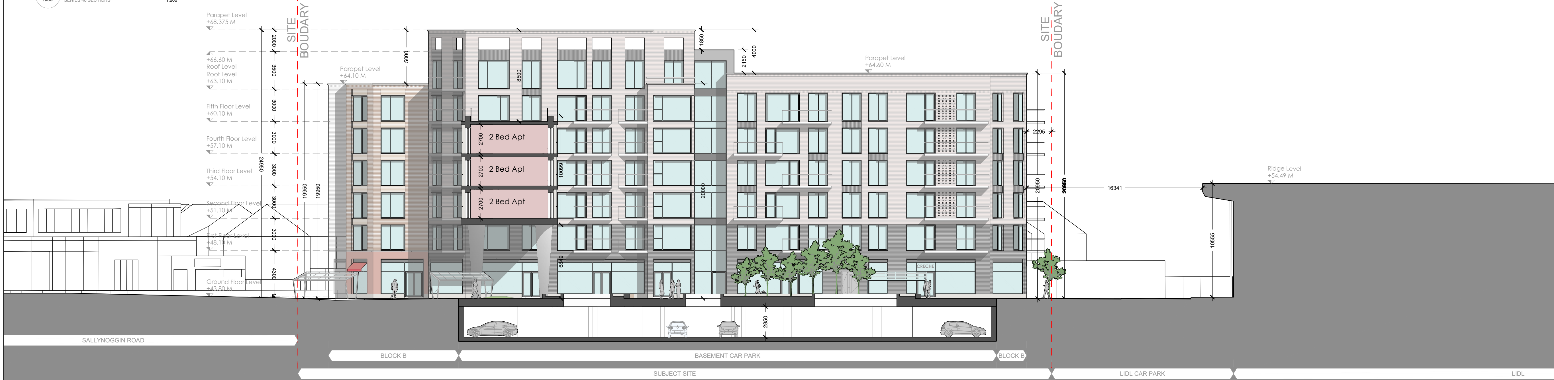
02 Elevation North West - Block B FIGURE 02 SERIES 40 SECTIONS 1:200