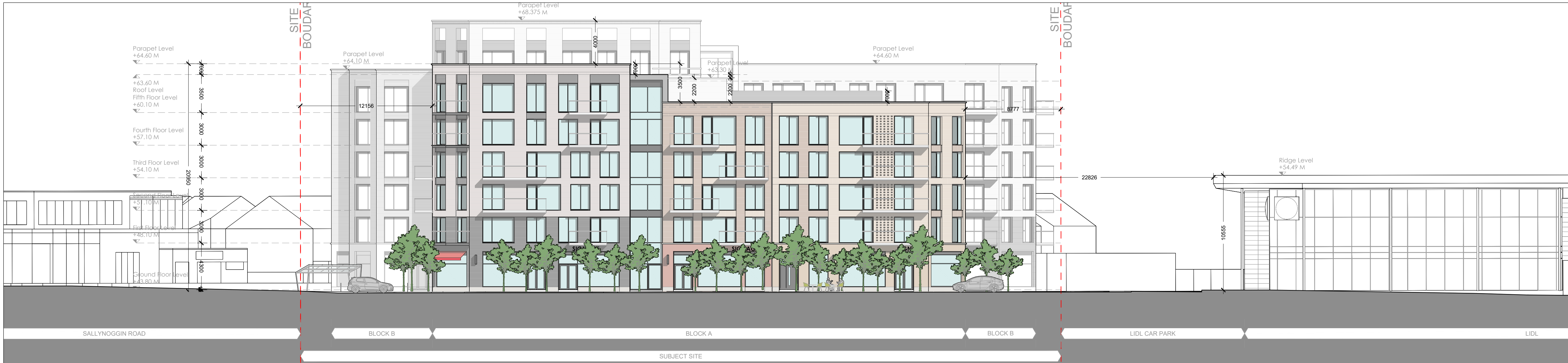
01 Elevation North West - Block A FIGURE 01 SERIES 40 SECTIONS 1:200