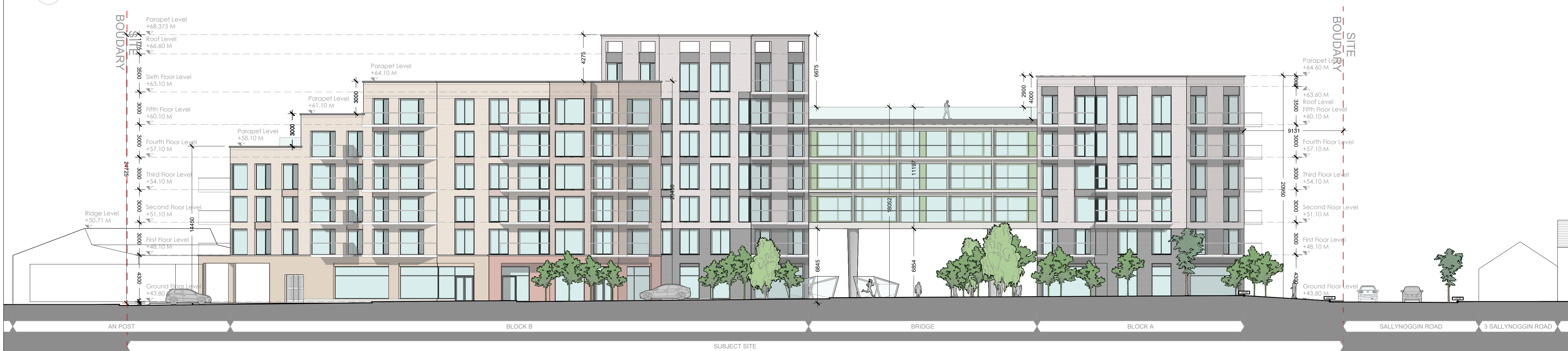
03 Elevation North East - Block A and B FIGURE 03 SERIES 40 SECTIONS 1:200