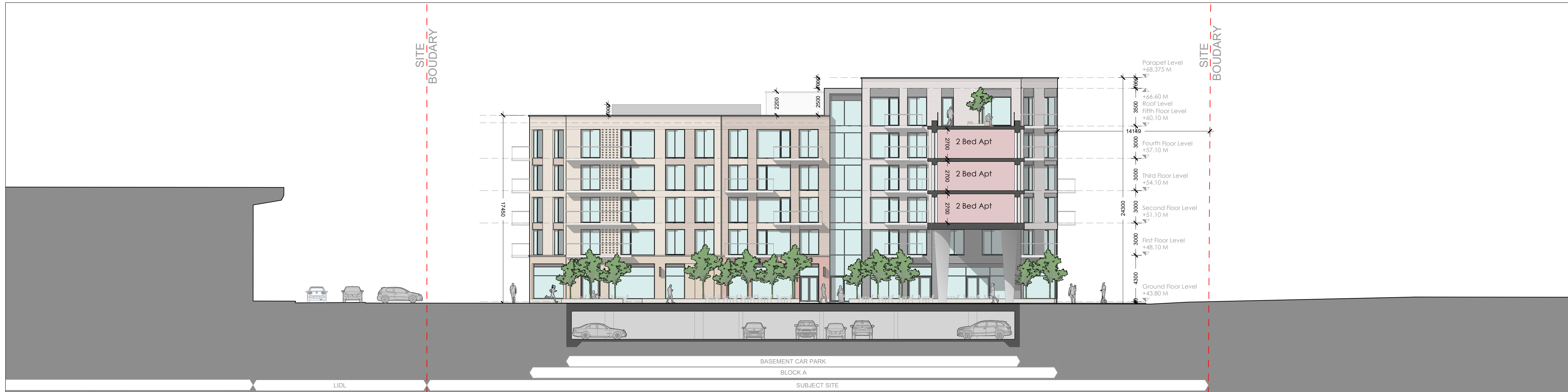
01 Elevation North West - Block A PAR01 SERIES 40 SECTIONS 1:200