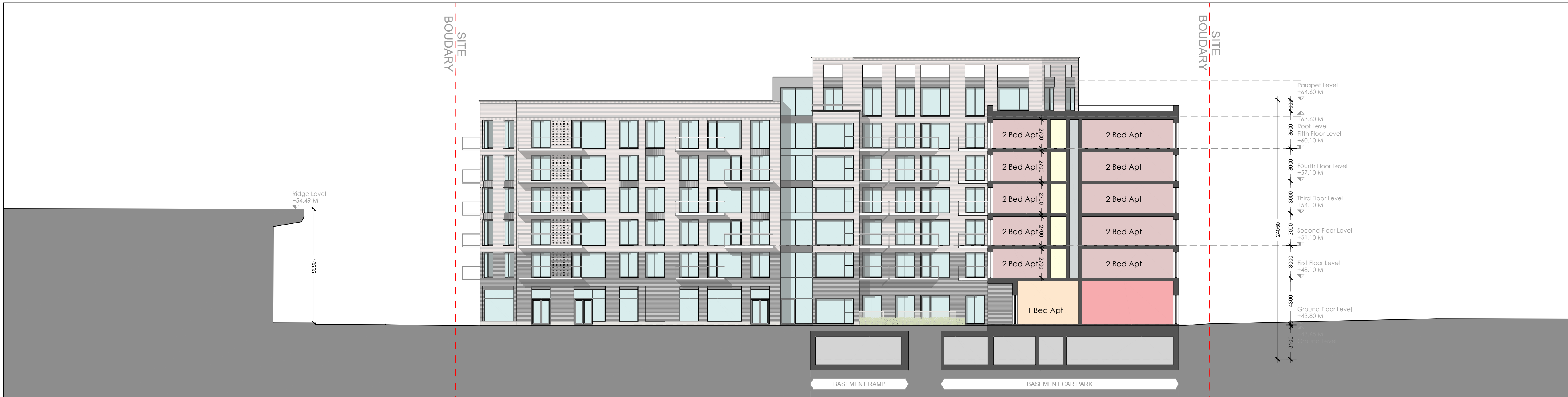
01 Elevation South West - Block B 1:200