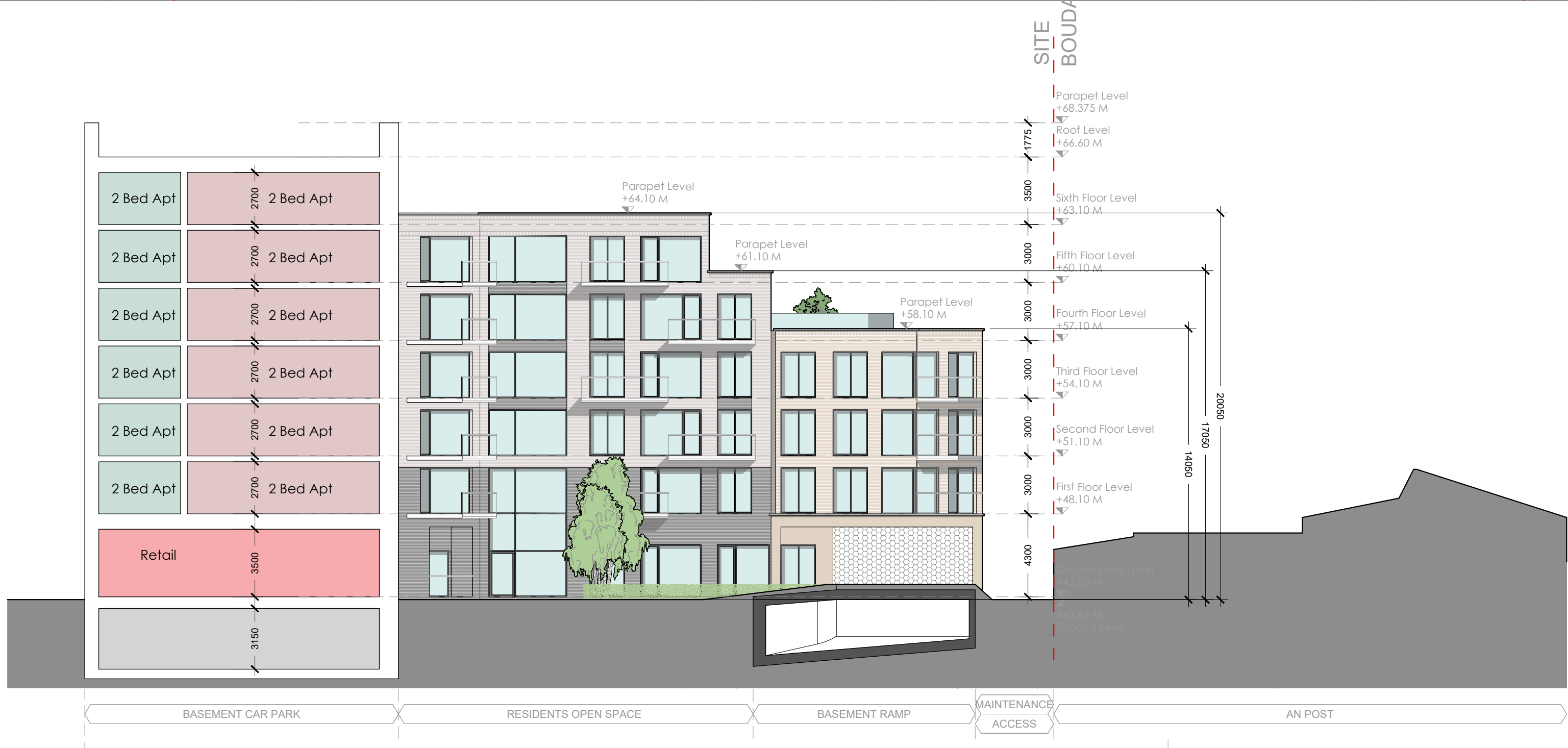
02 Elevation West - Block B 1:200