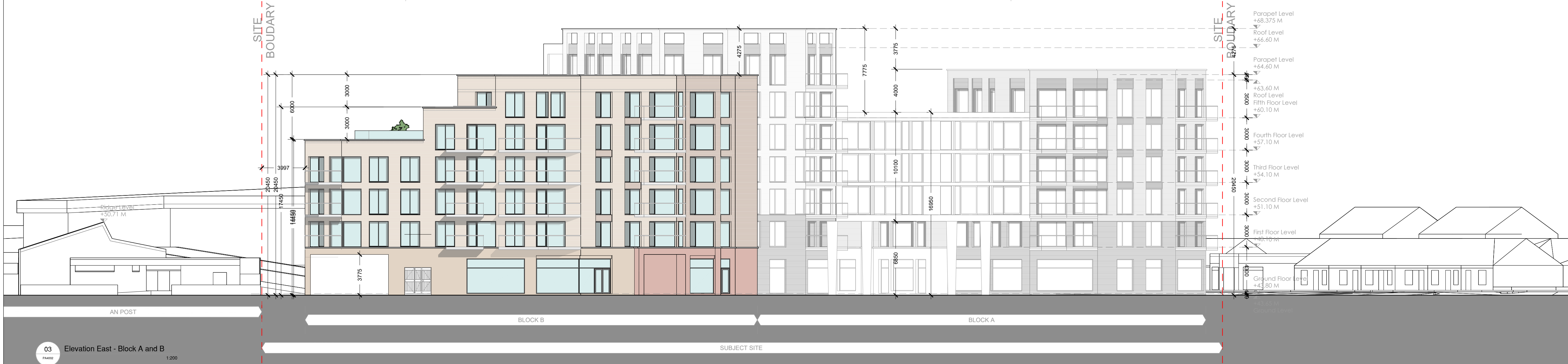
03 Elevation East - Block A and B 1:200