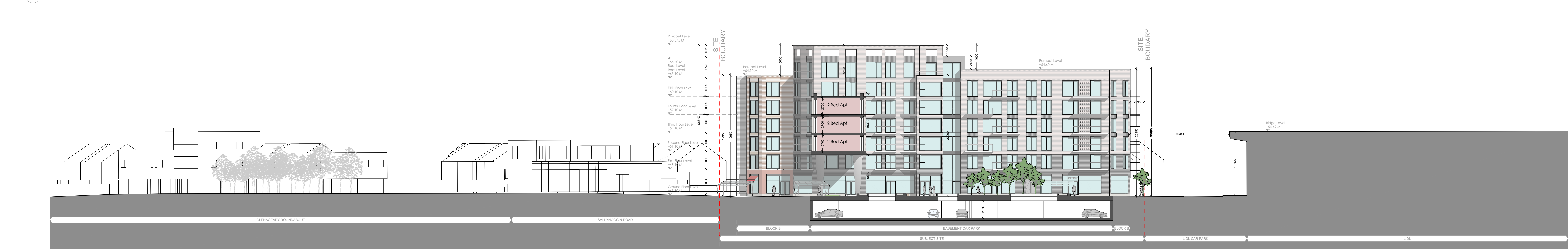
02 Contiguous Elevation North West - Block B SERIES 40 SECTIONS 1:250