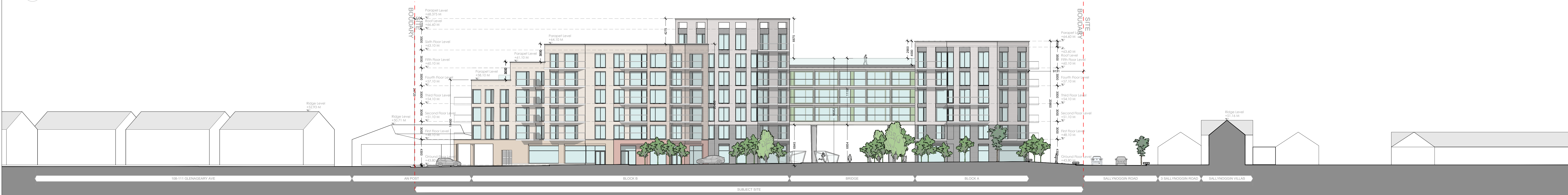
03 Contiguous Elevation North East - Block A and B SERIES 40 SECTIONS 1:250