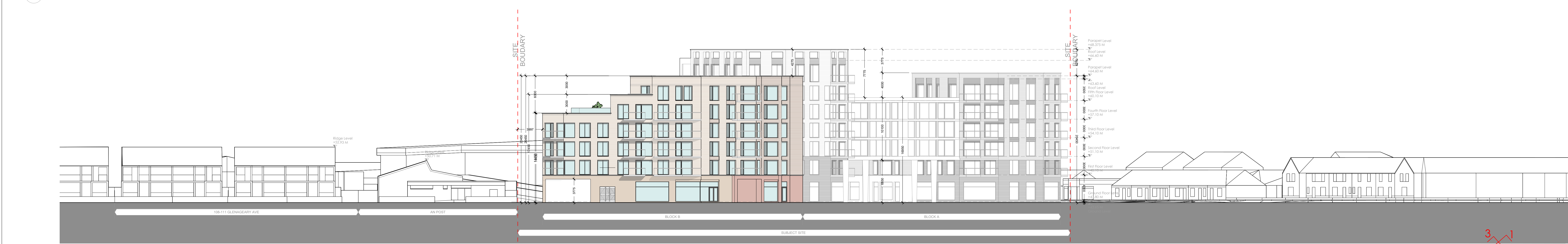
04 Contiguous Elevation East - Block B SERIES 40 SECTIONS 1:250