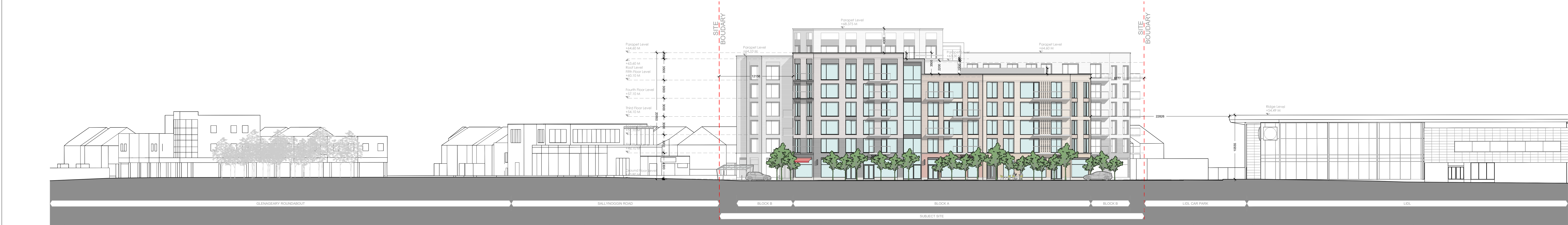
01 Contiguous Elevation North West - Block A SERIES 40 SECTIONS 1:250