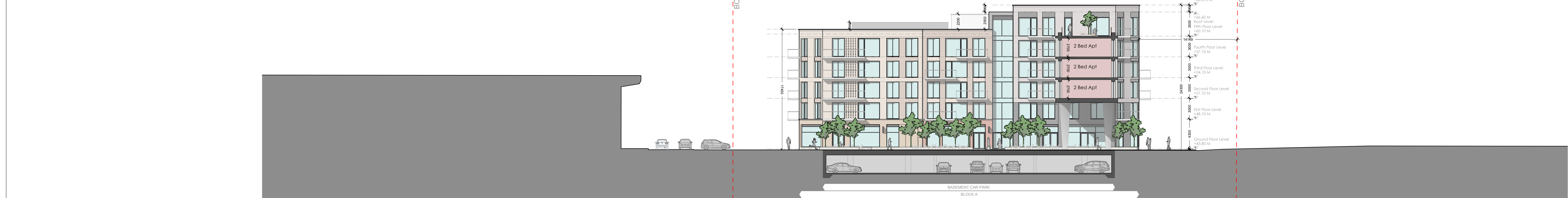
02 Contiguous Elevation South East - Block A SERIES 40 SECTIONS 1:250