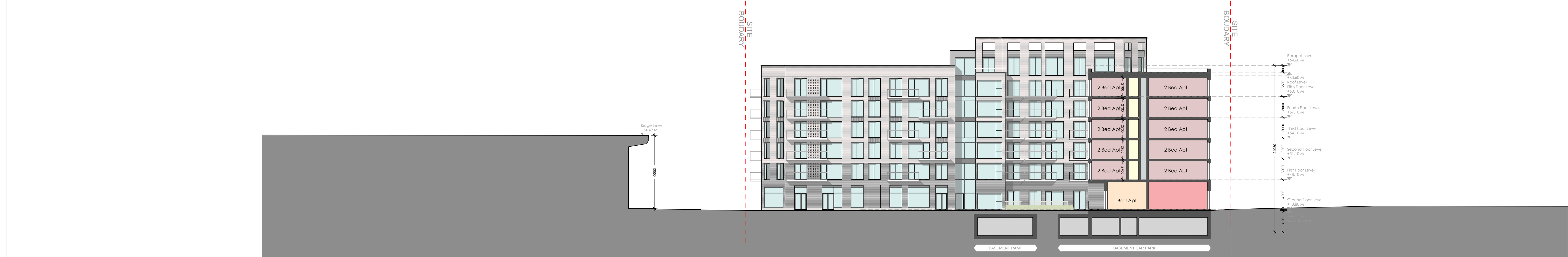
01 Contiguous Elevation South East - Block B SERIES 40 SECTIONS 1:250