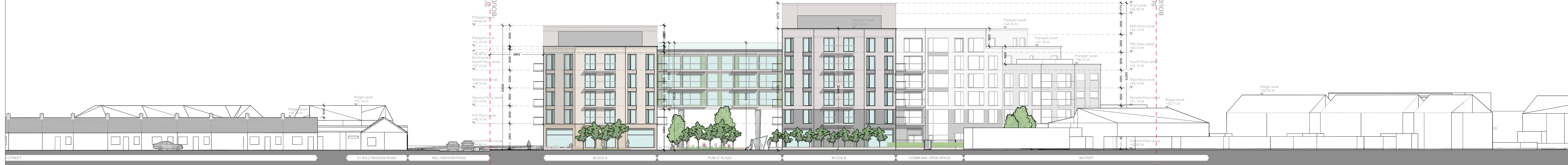
03 Contiguous Elevation South West - Block B SERIES 40 SECTIONS 1:250