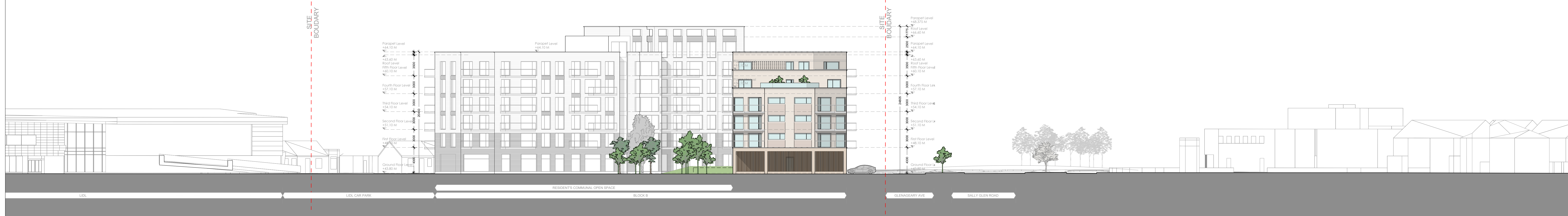
04 Contiguous Elevation South - Block A and B SERIES 40 SECTIONS 1:250